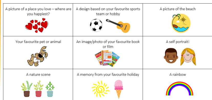
Postcards of kindness – ideas

You might want to plan out your design on a rough piece of paper first. Could you use photographs, collage, pen or paint?